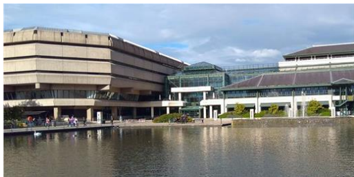
The National Archives (courtesy of Linda Newey)